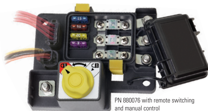
PN 880076 with remote switching and manual control