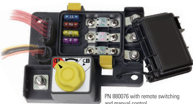
PN 880076 with remote switching and manual control