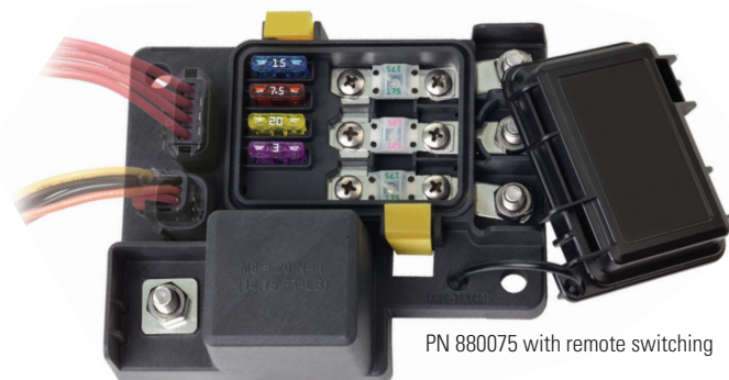
PN 880075 with remote switching