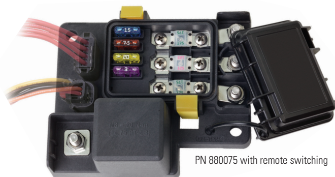
PN 880075 with remote switching